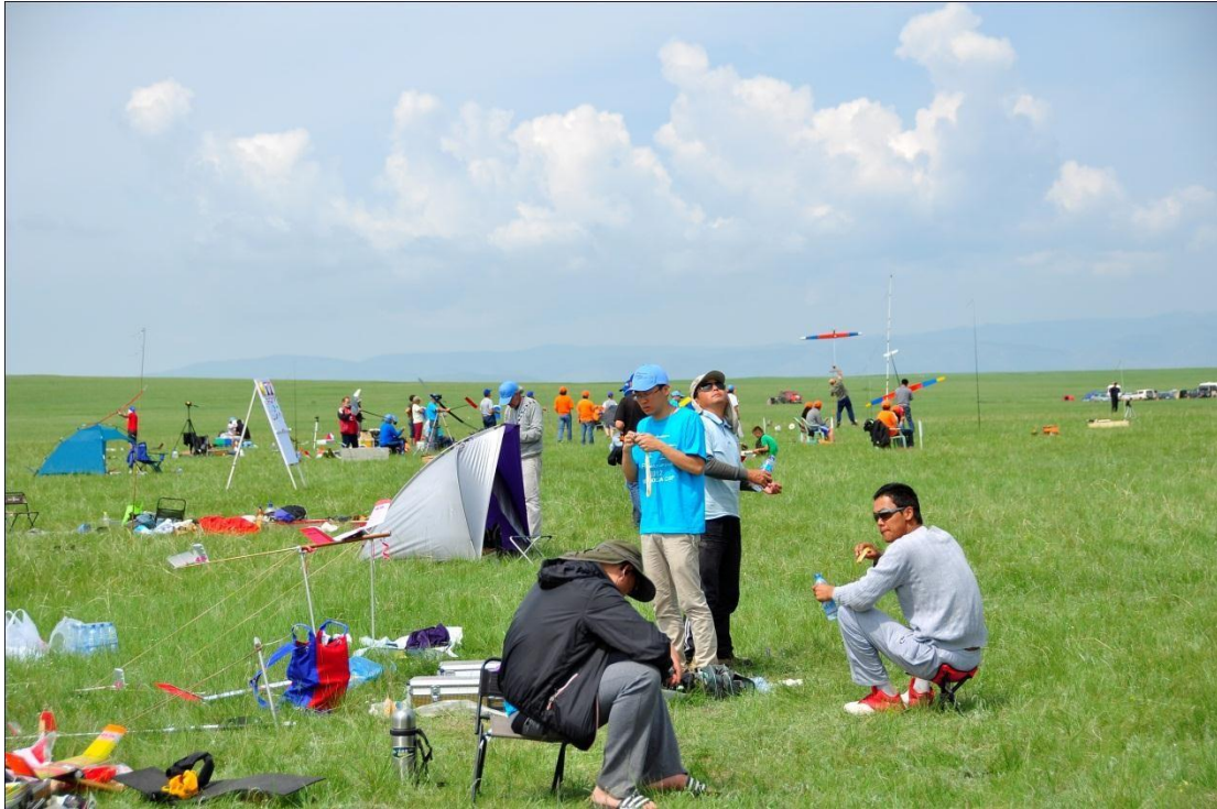
Flying Site – the Field of “Darkhan Noyonii Khudag” (47 0 71’43.80”, 107 0 42’47.74”)