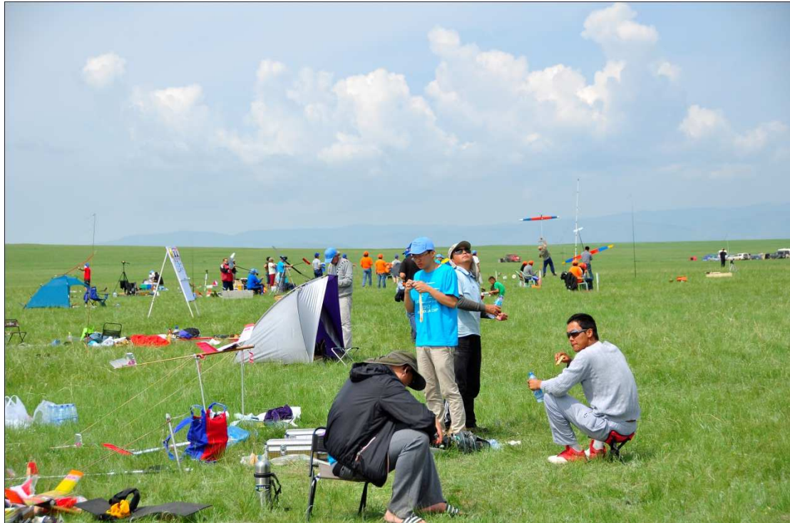
Flying Site – the Field of “Darkhan Noyonii Khudag” (47°71’43.80”, 107°42’47.74”)